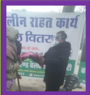
Words of a farmer after receiving a Blanket

"This blanket is more than just warmth; it's a symbol of hope. In the harsh Bihar Winters, it is a lifesaver. I am grateful to the Basara Educational and Welfare Society for their generosity. Their kindness has made a real difference in our lives."