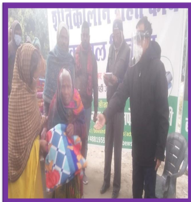
Blanket Distribution During a camp