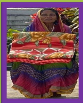
A poor farmer lady with 4 children after receiving Shawls and Blankets during a blanket donation camp

"These shawls and blankets are like warm hugs from the sky. They have brought warmth to our bodies and hope to our hearts. Now, my children will not have to shiver through the night. I'm so grateful to the Basara Educational and Welfare Society for their kindness."